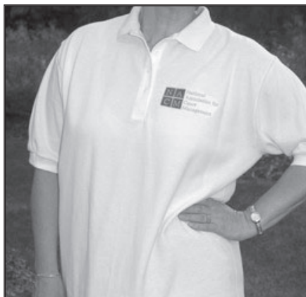
Women's white polo shirt